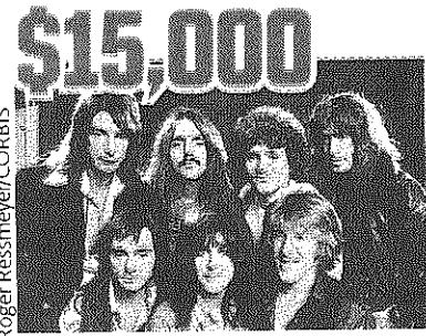
$15,000 Jefferson Starship The '70s supergroup is still rockin' — for a price.

Three (relatively) affordable musicians for hire*