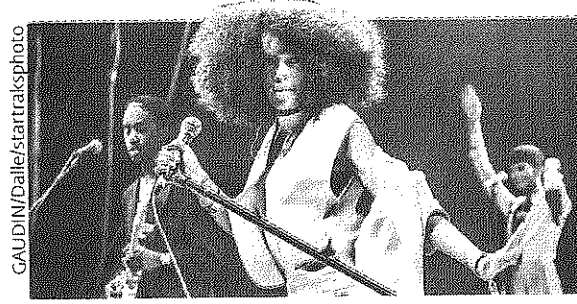
$10,000 Solange Knowles Beyoncé's younger sis commands about 1/100 of what Bey would.